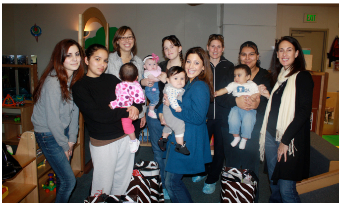
Delivering Valentine gift bags at the Redwood Child Development Center